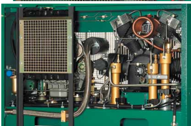
LW 570 D Rear view